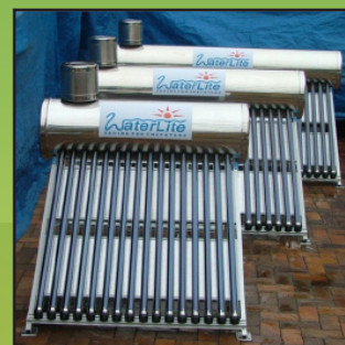
Waterlite high-pressure unit